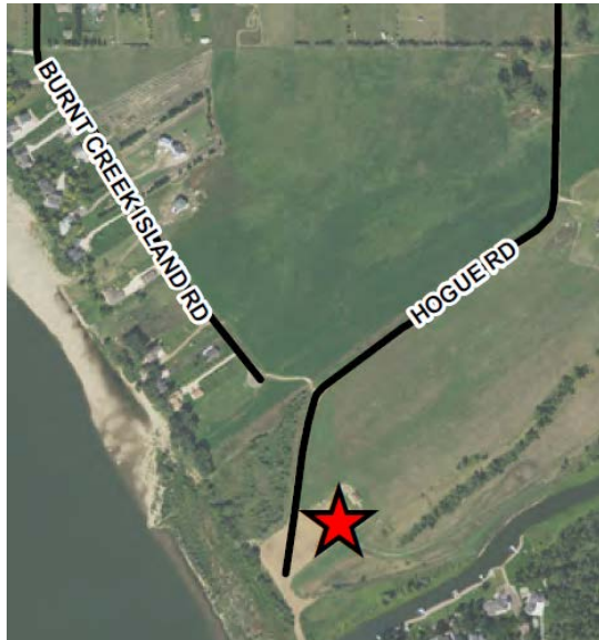
Hogue Island Boat Ramp Sandbagging Site Hogue Road

Bismarck, ND—Burleigh County has established two, self-fill sandbagging sites for citizens to fill and take sandbags, free of charge. Citizens need to bring their own shovels and gloves.